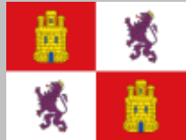
Castilla y León