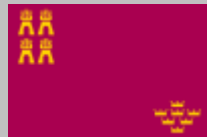
Región de Murcia