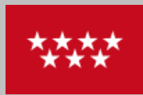
Comunidad de Madrid