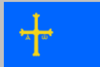
Principado de Asturias