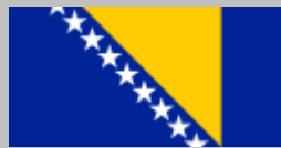
Bosnia and Herzegovina